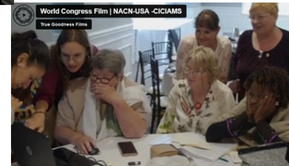
World Congress Film | NACN-USA -CICIAMS