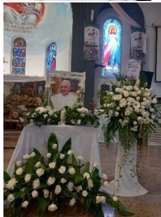
Divine Mercy Chaplet, Rosary and the Holy Sacrifice of the Mass for Our Late Pope Francis daily, 21.4.25-4.5.25 at St. Louis Church, Taiping 34000, Perak, Malaysia