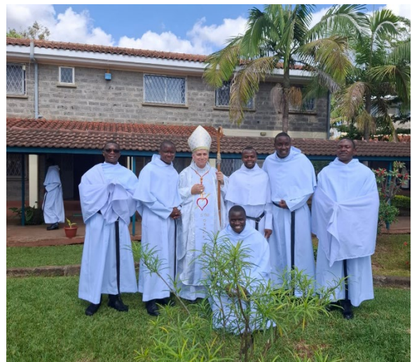
The future Pope Leo XIV, visiting the Augustinian Community in Karen (Langata South Road), near Tangaza University–CUEA. It is a small world