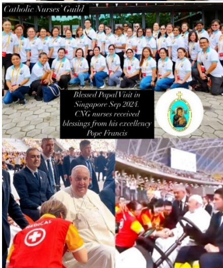
Catholic Nurses' Guild (CNG)-Singapore members volunteered as first aiders during the Holy Father Pope Francis' visit to Singapore in September 2024

International Catholic Committee of Nurses and Medical Social Assistants, CICIAMS Secretariat, Palazzo San Calisto 16, Vatican City 00120 www.ciciams.org 21 April 2025, ciciams@vatican.va 2025-04-21