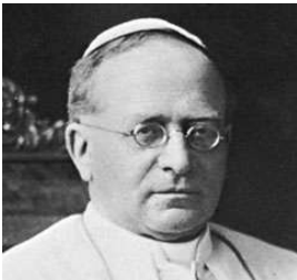
His Holiness Pope Pius XI 1922-1939

DONATIONS for the PERIOD FRIENDLY WORLD / MENSTRUAL HYGIENE PROJECT can be wired to CICIAMS at the IOR/Vatican Bank – http://www.ciciams.org/donatetoCICIAMS.html Contact the Secretary General for questions: CICIAMSInternational12@gmail.com