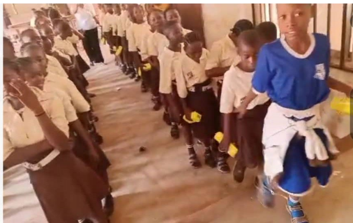
← Distribution of pad to Junior Secondary Students