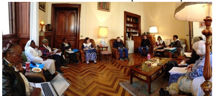
CICIAMS Executive Board Meeting-Day 2 at Maryknoll House