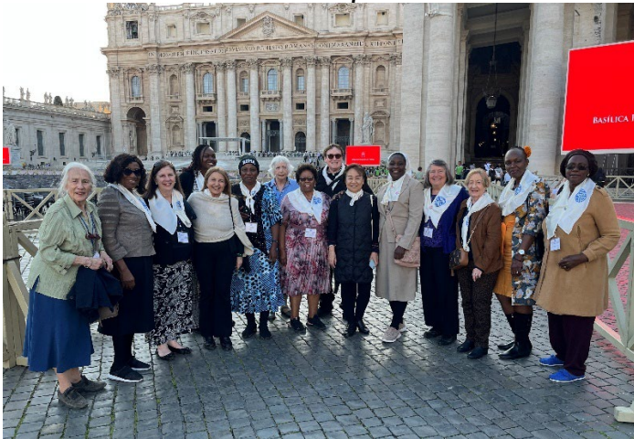
CICIAMS Executive Board enroute to the Holy Door of St. Peter's Basilica, Jubilee for the Sick and Healthcare Workers, Vatican City, April 3, 2025 / Holy Doors ▼