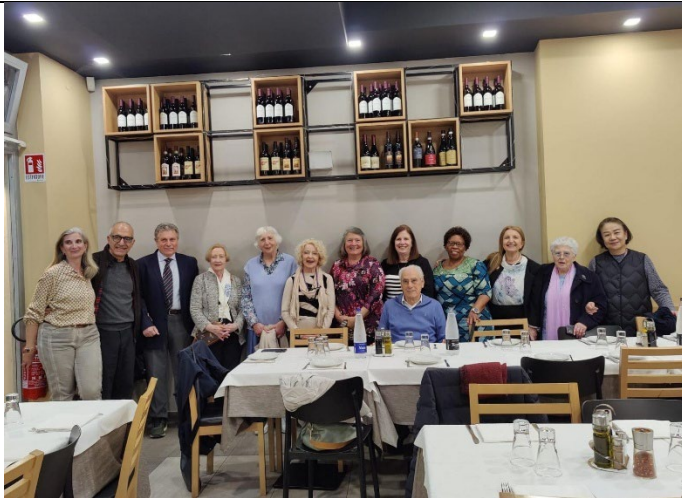
Dinner with colleagues from the