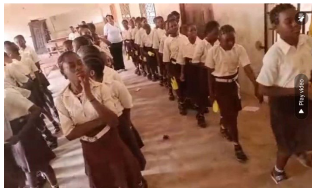
Distribution of pad to Senior Secondary Students

Demonstration on how to handle and apply the sanitary pad