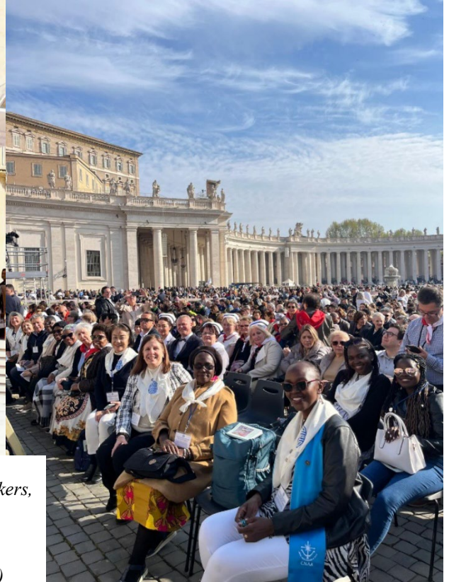
His Holiness Pope Francis blessing the faithful assembled at the Holy Sacrifice of the Mass for the Jubilee for the Sick and Healthcare Workers, April 6, 2025, St. Peter's Square

CICIAMS Executive Board members front row followed by members of Catholic Association of Polish Nurses and Midwives / Katolickie Stowarzyszenie Pielęgniarek i Położnych Polskich (KSPiPP) and healthcare workers from around the world