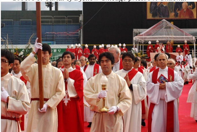
This is a celebration of the benedictions of 188 Japanese martyrs, held at Nagasaki Prefectural Baseball Stadium in 2008. Among them were Japanese members of the Augustinian Order, so Pope Leo XIV attended as the Superior General of the Augustinian Order. I was also at the venue. I am deeply moved.

← Pictures provided by nurses from each country.