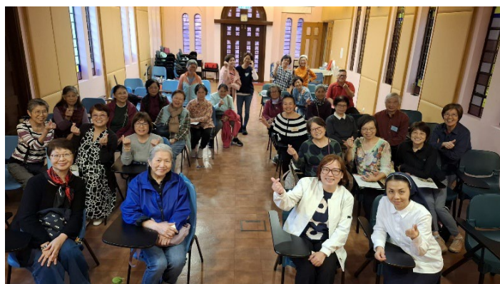
Fig.1 Members and their friends who participated in the retreat