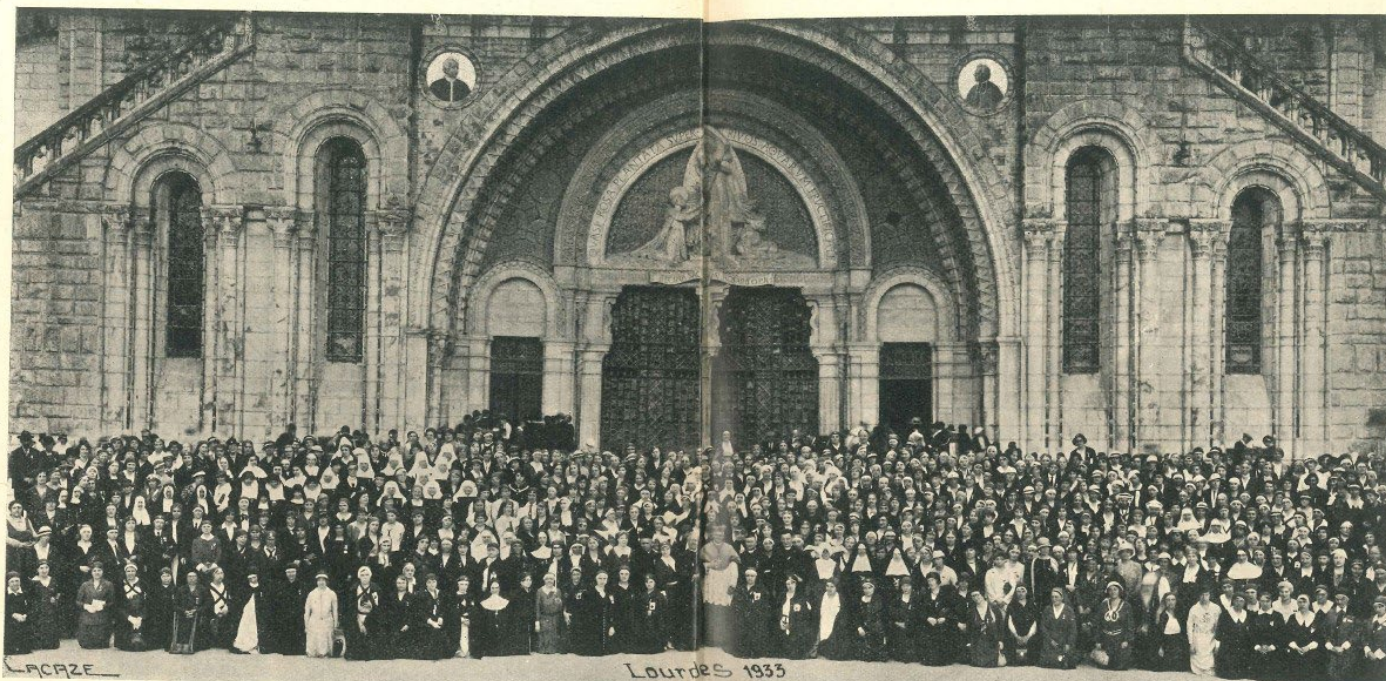
UCZESTNICZKI MIĘDZYNARODOWEGO KONGRESU PIEŁĘGNIAREK KATOLICKICH PRZED GŁÓWNA BAZYLIKĄ W LOURDES.

“...You who live in permanent contact with suffering, you who may so easily fall into doubt witnessing the terrible devastation caused by sickness, listen to Our Lady. She will teach you that suffering has its providential, irreplaceable significance in the world.